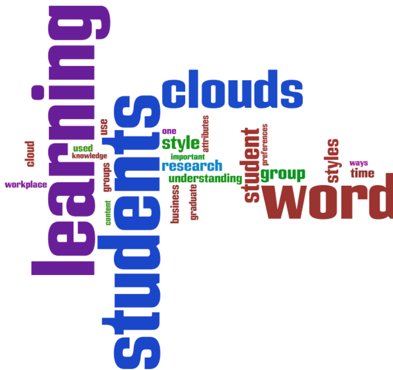
Figure 1. Wordle word cloud of this article.

Key words: accounting education, deep learning, graduate attributes, Kolb's learning styles inventory, motivation, workplace learning, word clouds.