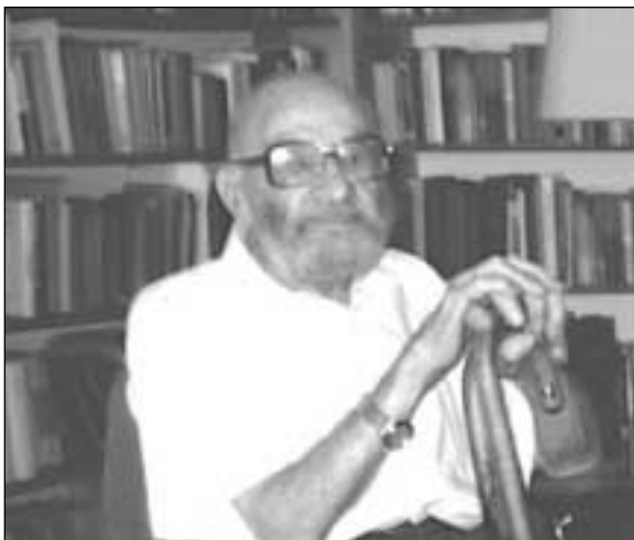
Paul Weiss, in his Washington, D.C. apartment, 12 Aug. 2000